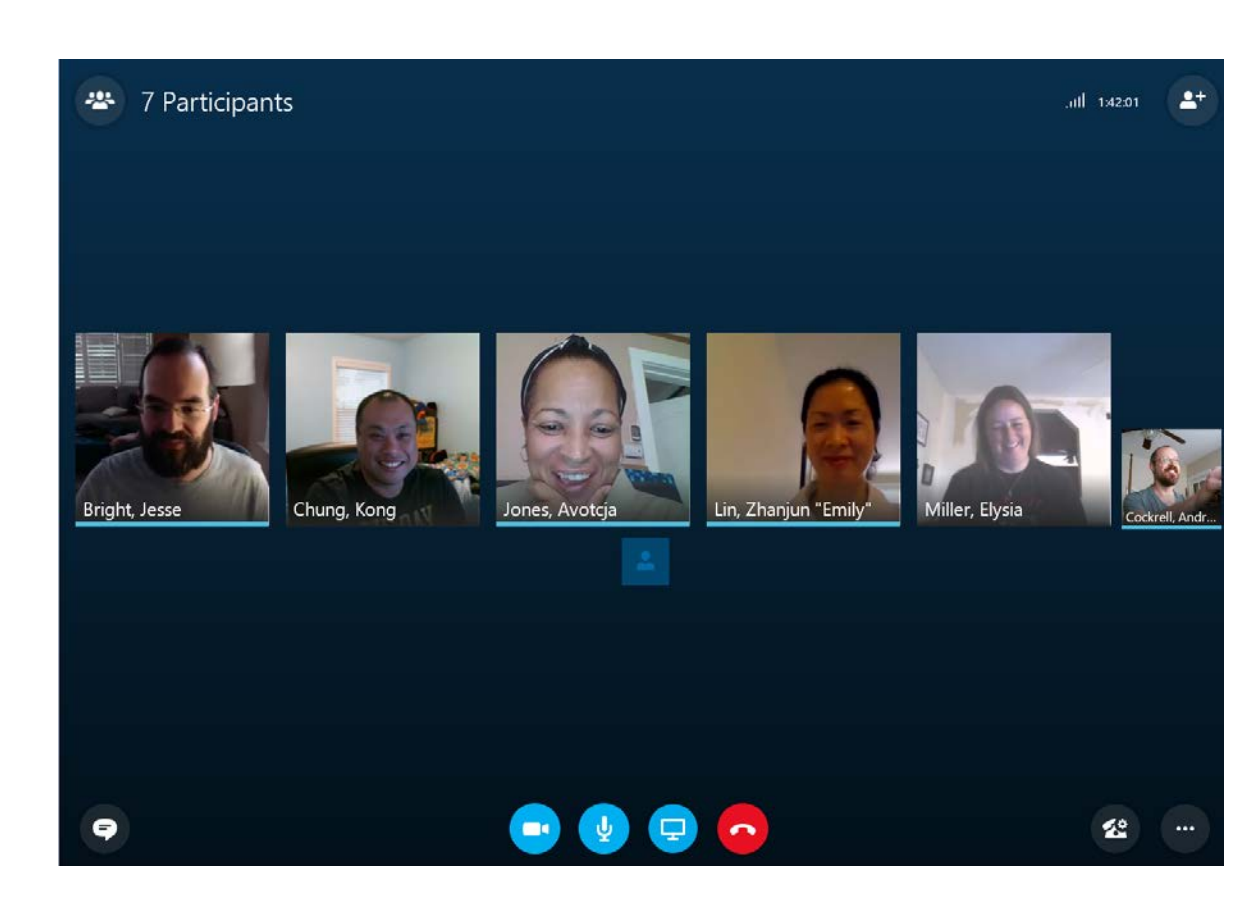
City of Berkeley Plan Check Staff