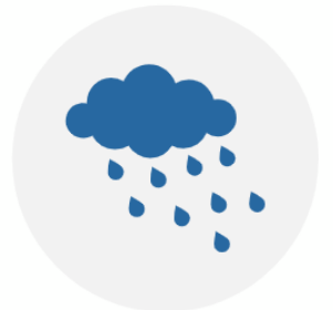
Like air and water...

Food is essential for survival and the only commodity that cannot be postponed.