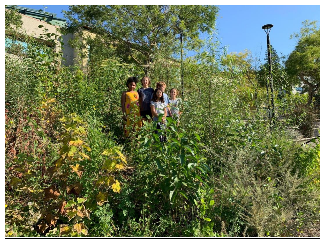
Students at Cragmont Elementary School in approx. 1 year's growth