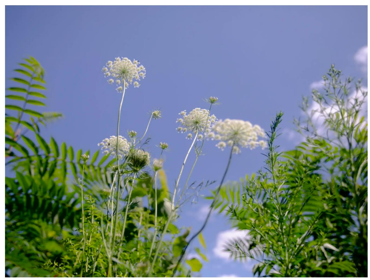
Flowers in the Miyawaki forest in Danehy Park, which includes 1,400 native shrubs and saplings, all thriving in an area roughly the size of a basketball court.

Perhaps more important for urban areas, tiny forests can help lower temperatures in places where pavement, buildings and concrete surfaces absorb and retain heat from the sun.