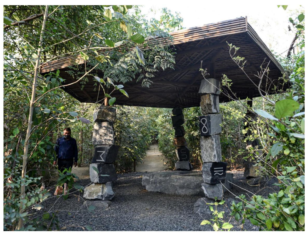
A Miyawaki forest in New Delhi.

Dr. Miyawaki's prescription involves intense soil restoration and planting many native flora close together. Multiple layers are sown — from shrub to canopy — in a dense arrangement of about three to five plantings per square meter. The plants compete for resources as they race toward the sun, while underground bacteria and fungal communities thrive. Where a natural forest could take at least a century to mature, Miyawaki forests take just a few decades, proponents say.