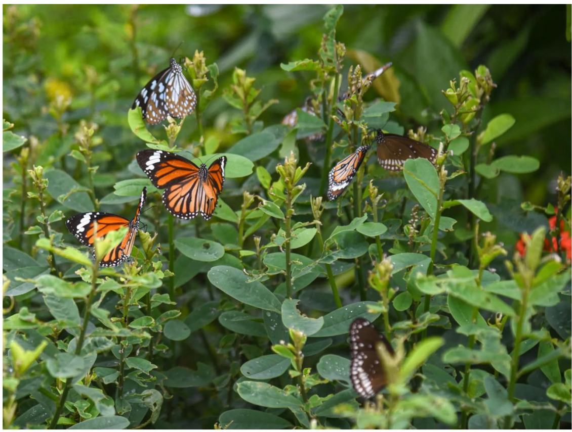
Butterflies in the Miyawaki forest of Kalina Biodiversity Park at Mumbai University, which opened last year.