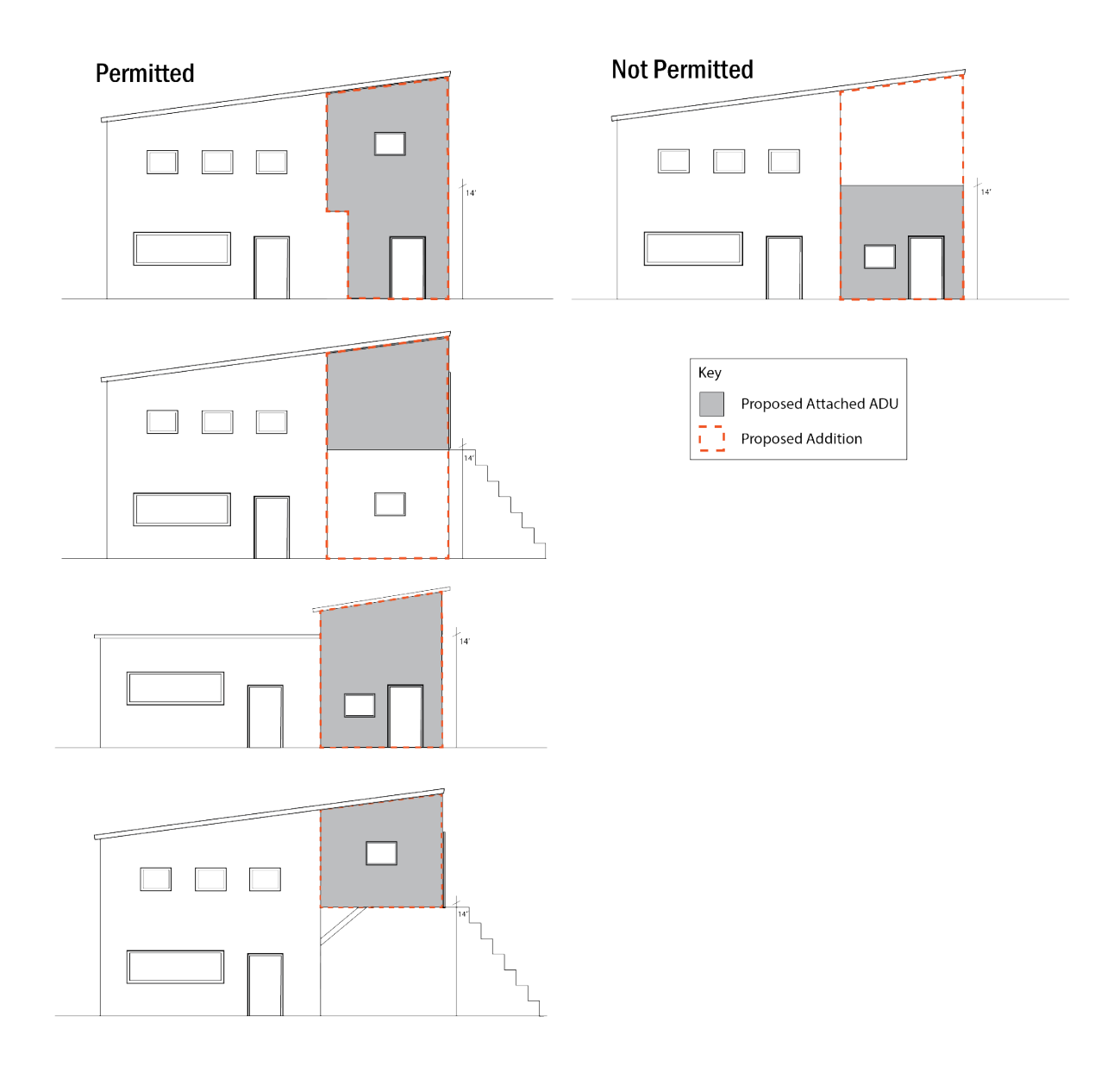
Figure 1 – Examples of Additions Over 14 ft. Containing Attached ADUs