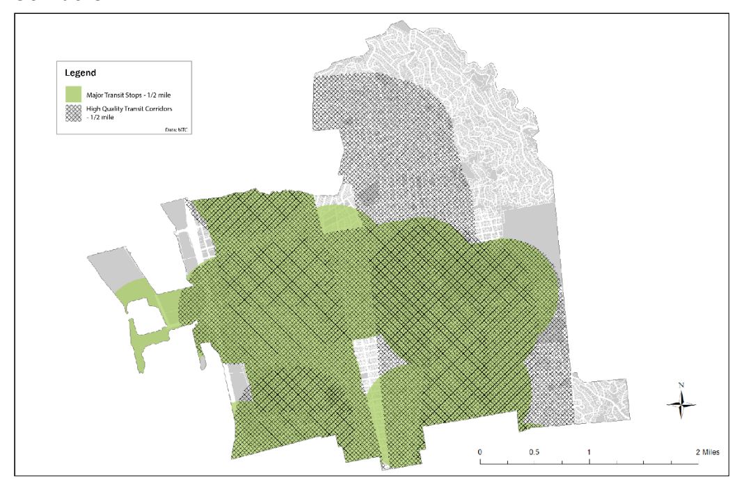
Figure 2: Areas within 1/2 mile of "Major Transit Stops" and "High Quality Transit Corridors"