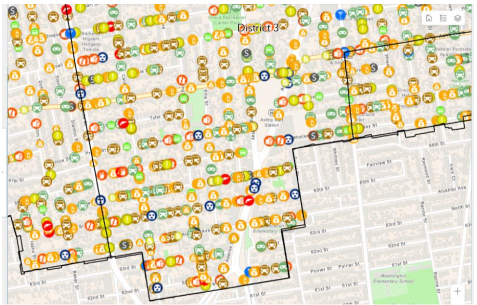
Map showing 1-year of crime data in vicinity of southern District 3.