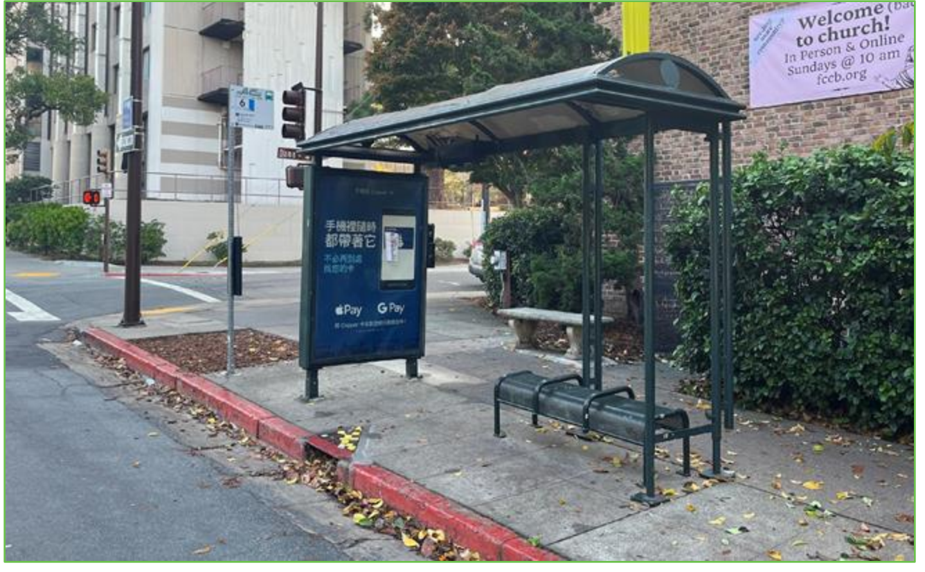
Existing Bus Stop Shelter (Open-back) at Durant and Dana