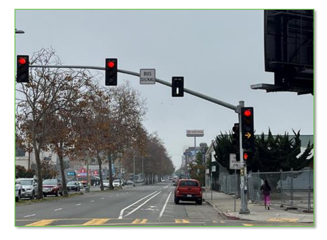
Bus Movement Active ("GO")