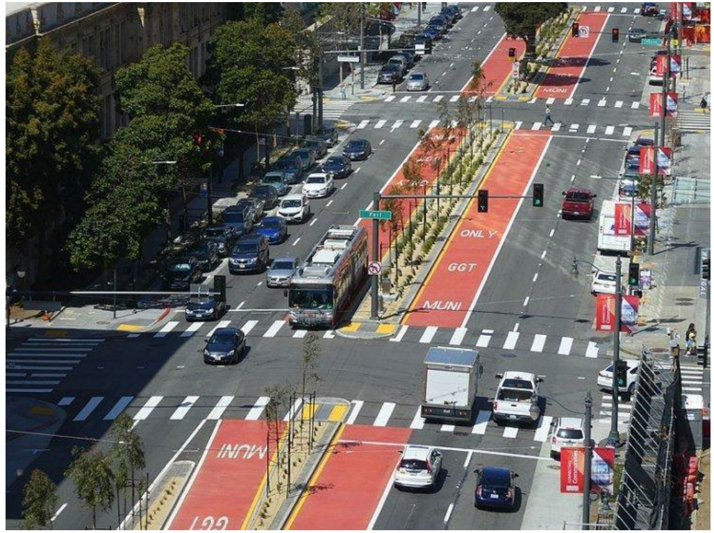
Van Ness Avenue, San Francisco