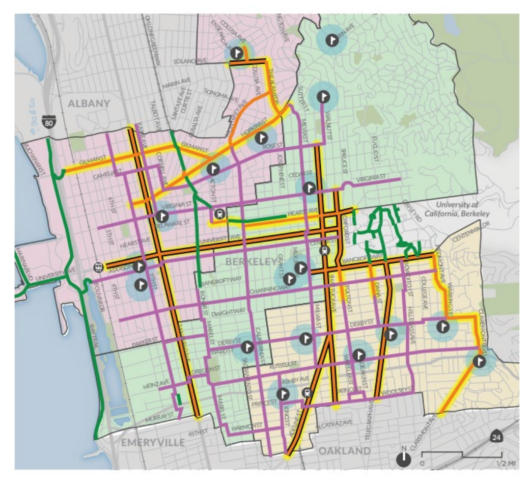
FIGURE 5-2: LOW-STRESS BIKEWAY NETWORK VISION WITH BERKELEY SCHOOLS PAVED PATH COMPLETE STREET CORRIDOR STUDIES LOW STRESS BIKEWAY RECOMMENDATION STUDY CYCLETRACK [4]* ENROLLMENT BOUNDARIES