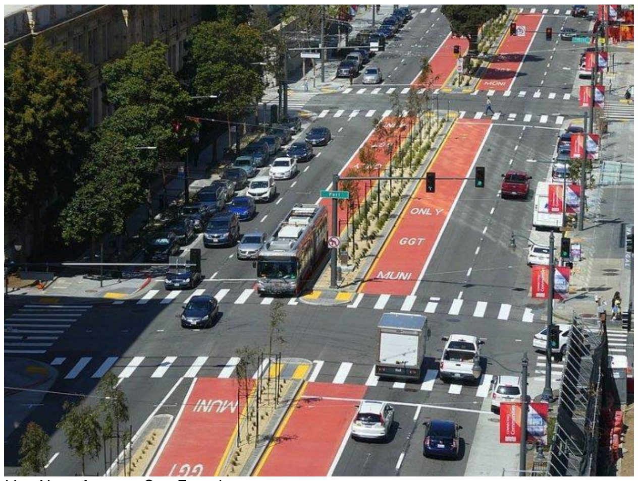
Van Ness Avenue, San Francisco